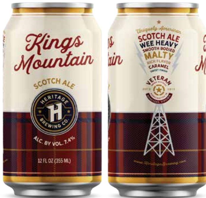
Kings Mountain Scotch Ale