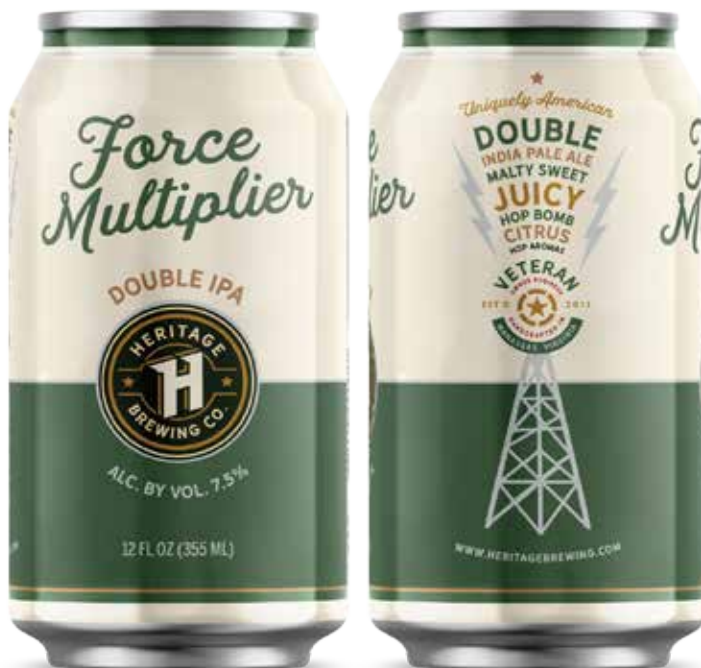
Force Multiplier Double IPA